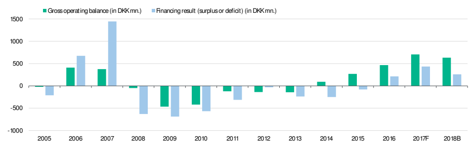
Exhibit 1 Financial surplus expected to be reported Gross operating balance and financing surplus (or deficit) in DKK million, by year

Note: 2017 shows latest government forecast; 2018 is budget.